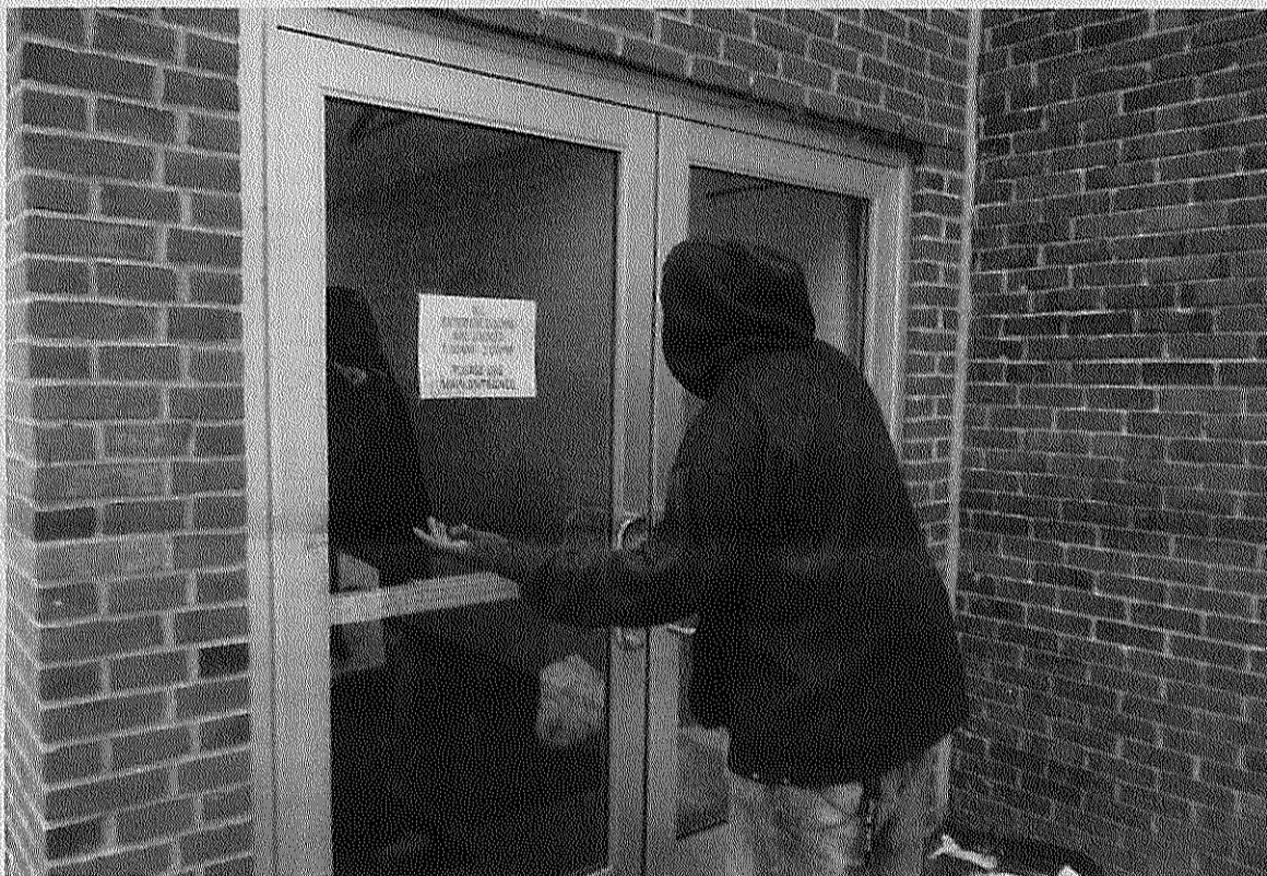
Re-enactment: A student attempts to enter SHS through the back door, to no avail.

Along with these measures of tighter policy, additional security and armed resource officers have been added. Additionally, all Stamford High teachers are now required to wear ID badges, all outside food delivery has been suspended, all visitors are to enter