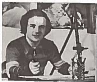
BE A SUCCESSFUL COMMERCIAL ARTIST

START YOUR CAREER AS A WELL PAID COMMERCIAL ARTIST.