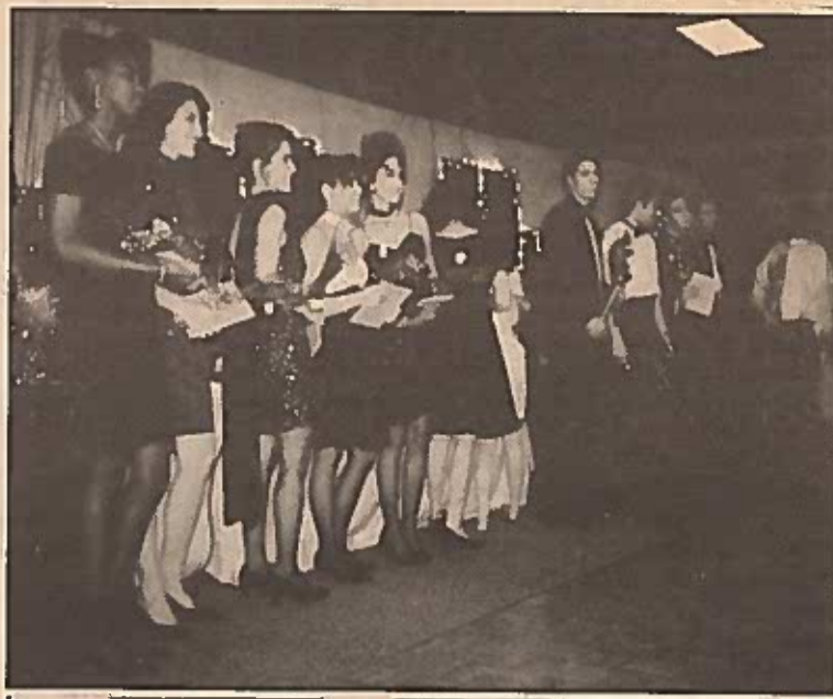
This year's prom differs from tradition.

Granted that this was planned to encourage students to party sober on prom night, it should not be viewed as a horrible event. It should be viewed as a fun night, unlike other weekends. Instead of going to a usual party just like every other weekend, why not do something different after the prom? Make the night of the much awaited senior prom worth all the anticipation.