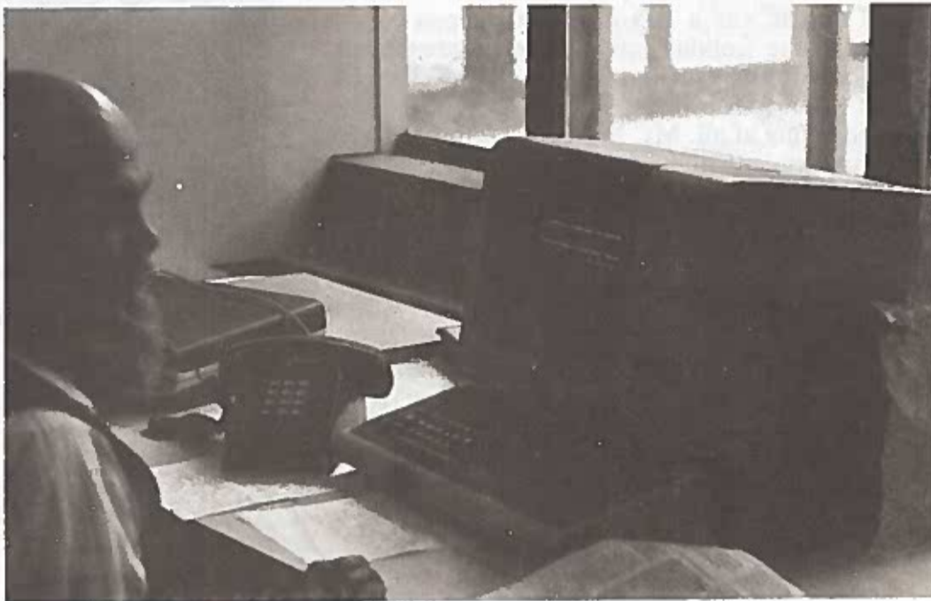
The telephone and the Dialer II computer are a team that will soon be delivering messages to the homes of SHS students and faculty.

Since the computer can only deliver one identical message to everyone, it cannot tell specifically which classes were missed. Therefore it could say that a student was absent from school, when he only missed the class in which general attendance was taken.