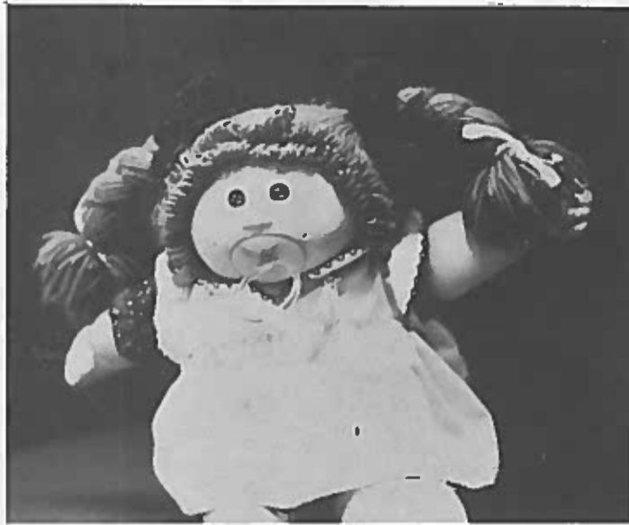
Coleco's Cabbage Patch Kids have become so popular that finding one requires the ingenuity of a first class sleuth.

The Round Table is published monthly by the Journalism