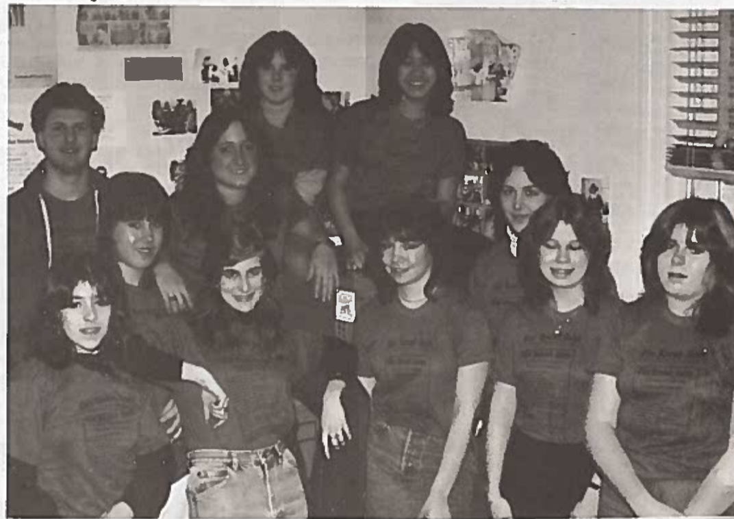
Members of The Round Table staff celebrate Pep Day by wearing their class T shirts displaying their school colors.

Insurance analysts believe the accident and fatality records of these small cars will only get worse. The Journal of American Insurance explains, these "Cars simply don't provide nearly as much crash protection for their occupants as today's heavier vehicles."