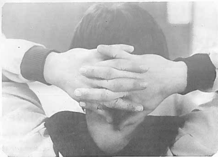
A contented senior relaxes after a filling meal of coq au vin in the brand new SHS Dining Hall.